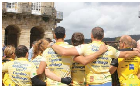
From 28 May to 7 June nine ArcelorMittal volunteers cycled 800km in tandem from Pamplona to Santiago de Compostela in Spain