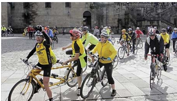
Arriving at the Obradoiro Square in Santiago de Compostela