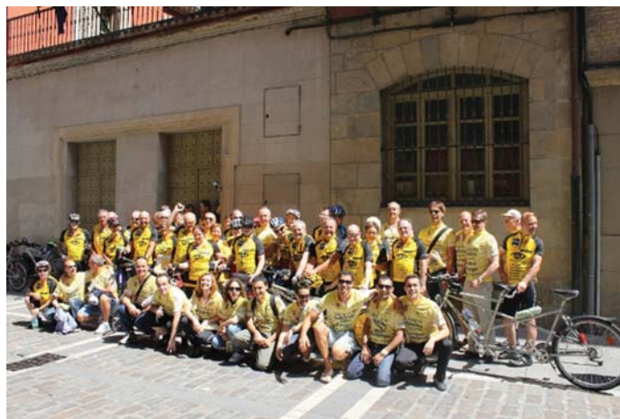
The group of cyclists on Arrival at Viana